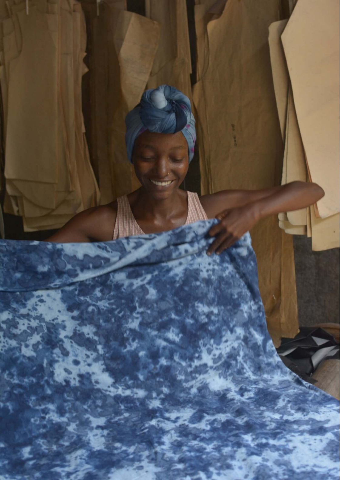
BumBoos in the making