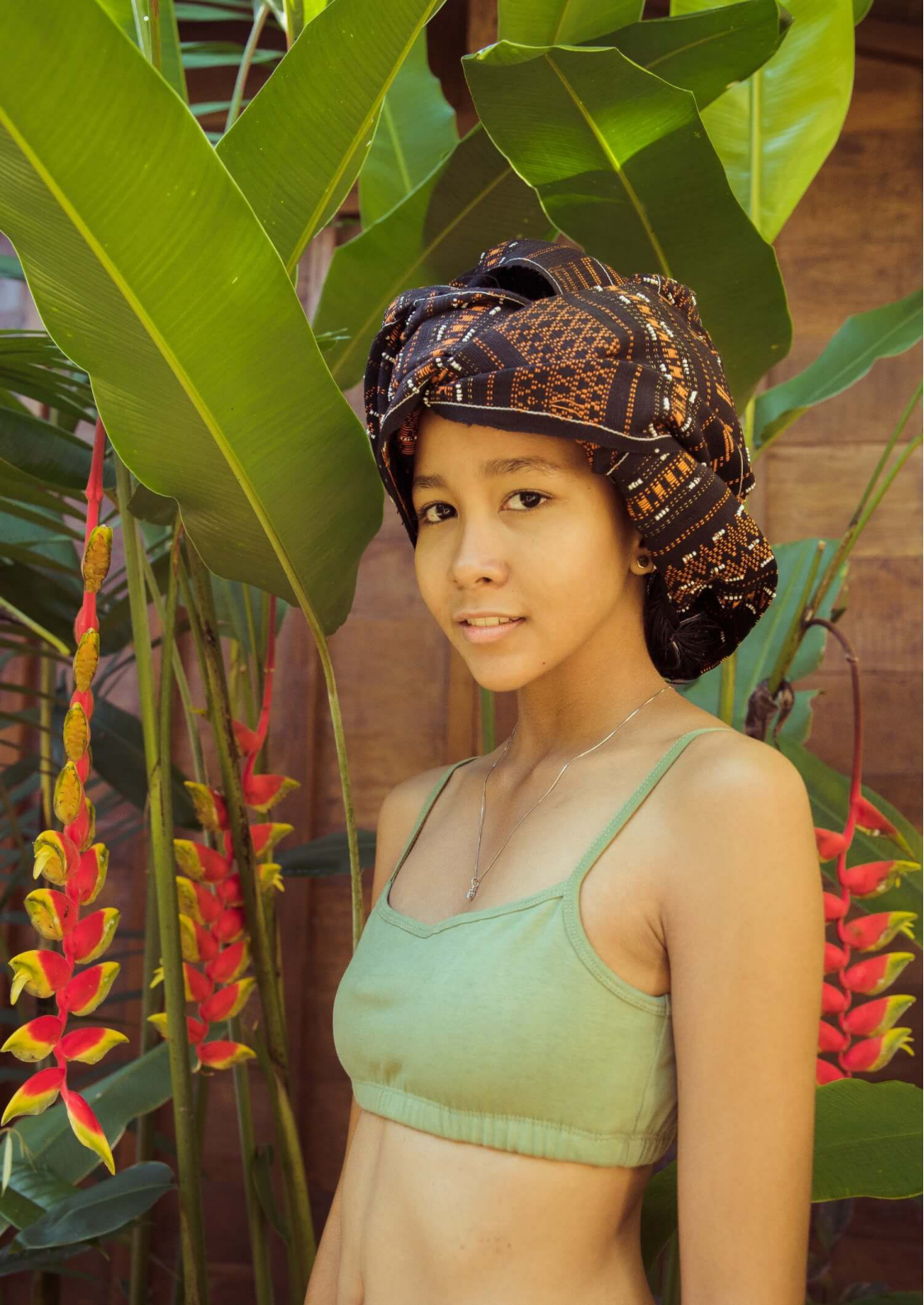
Olive Bra Top

To archived this colour, the fabric was dyed in indigo natural dye, washed, dried then dipped in mango leaf, which produces a natural yellow colour.