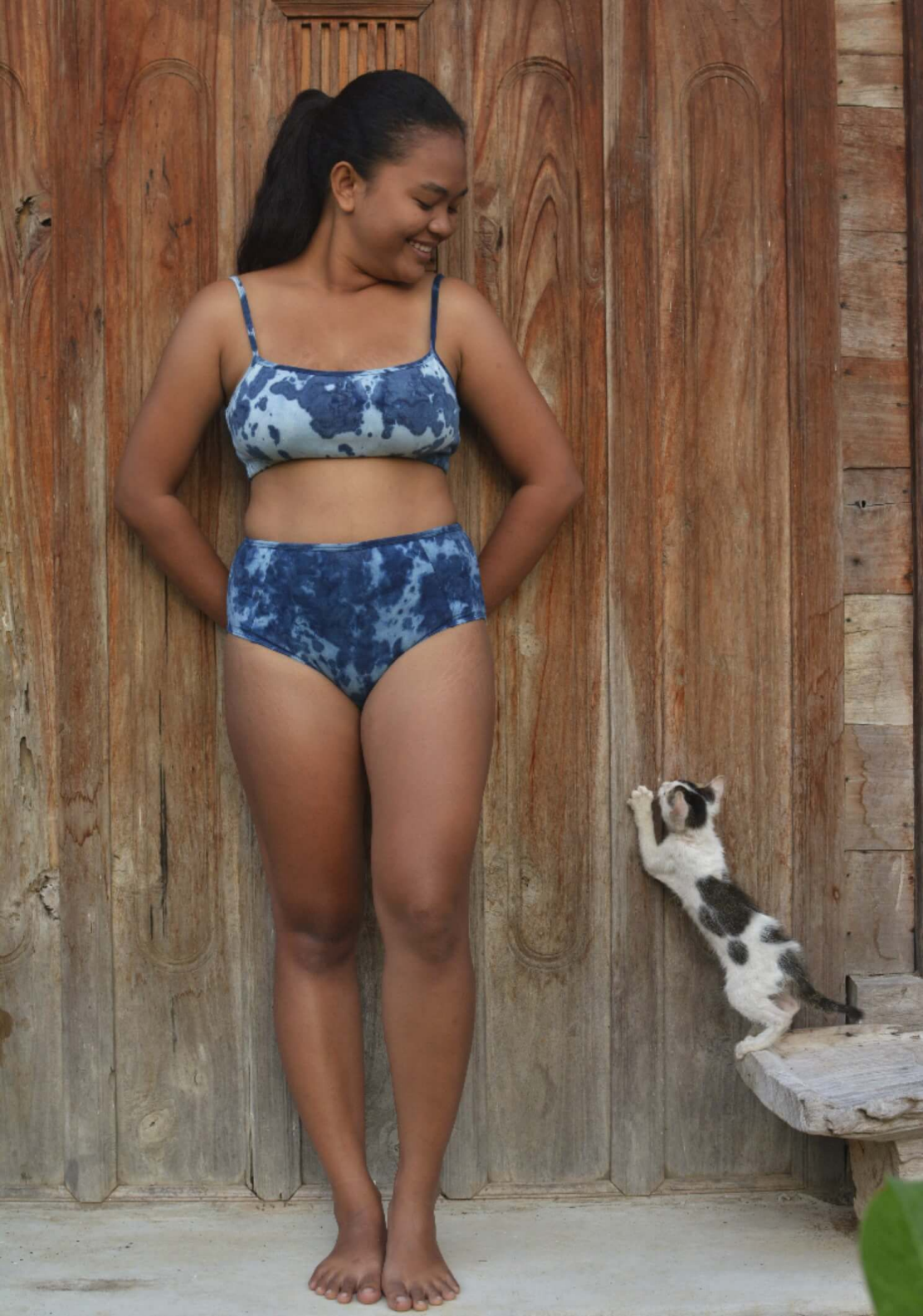
Lotus knickers Indigo natural dye, shibori style.