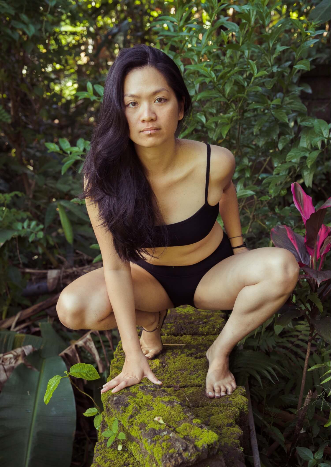
Lotus underwear set in soft bamboo fabric